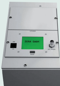
Display module STM4000